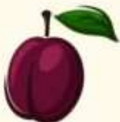
Prune* (Remove Pit)