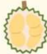
Durian (Remove Seed)