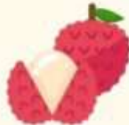
Lychee (Remove Pit)