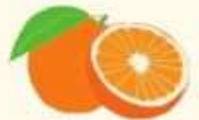
Orange (Remove Seed)