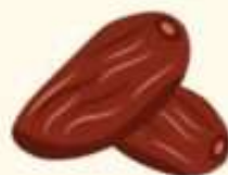
Red Date* (Remove Seed)