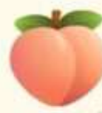
Peach* (Remove Pit)