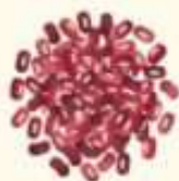
Red (adzuki) Bean