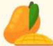
Mango (Remove Seed)