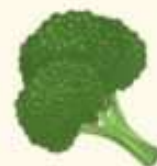
Broccoli Seed Buckwheat