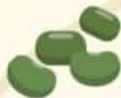
Green (mung) Bean