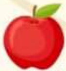
Apple* (Remove Seed)