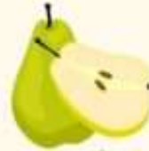
Pear* (Remove Seed)