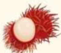
Rambutan* (Remove Pit)