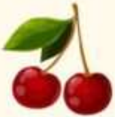
Cherry* (Remove Pit)