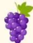
Grape (Remove Seed)