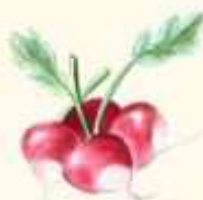
China Rose Radish