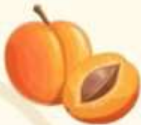
Apricot* (Remove Pit)